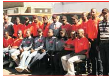
The new Witbank team