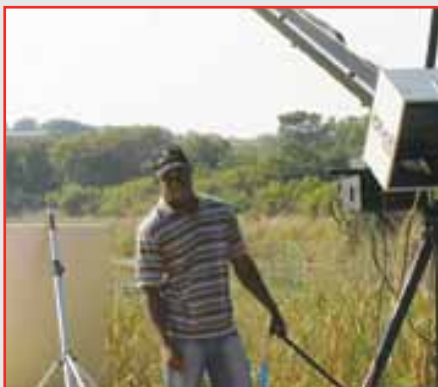
On location with the crew for Bisikele near the Lion Park...

"The new campaign does this. And it's taking the brand's presence to a new level."