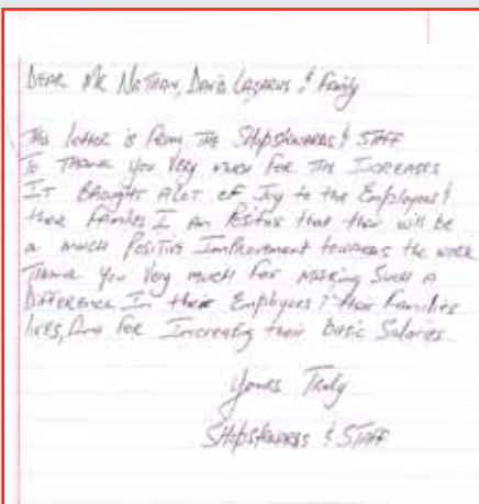
Handwritten note from Union representatives

This letter was received from Union shop stewards, expressing the gratitude of employees after learning that RAM has increased minimum wages.